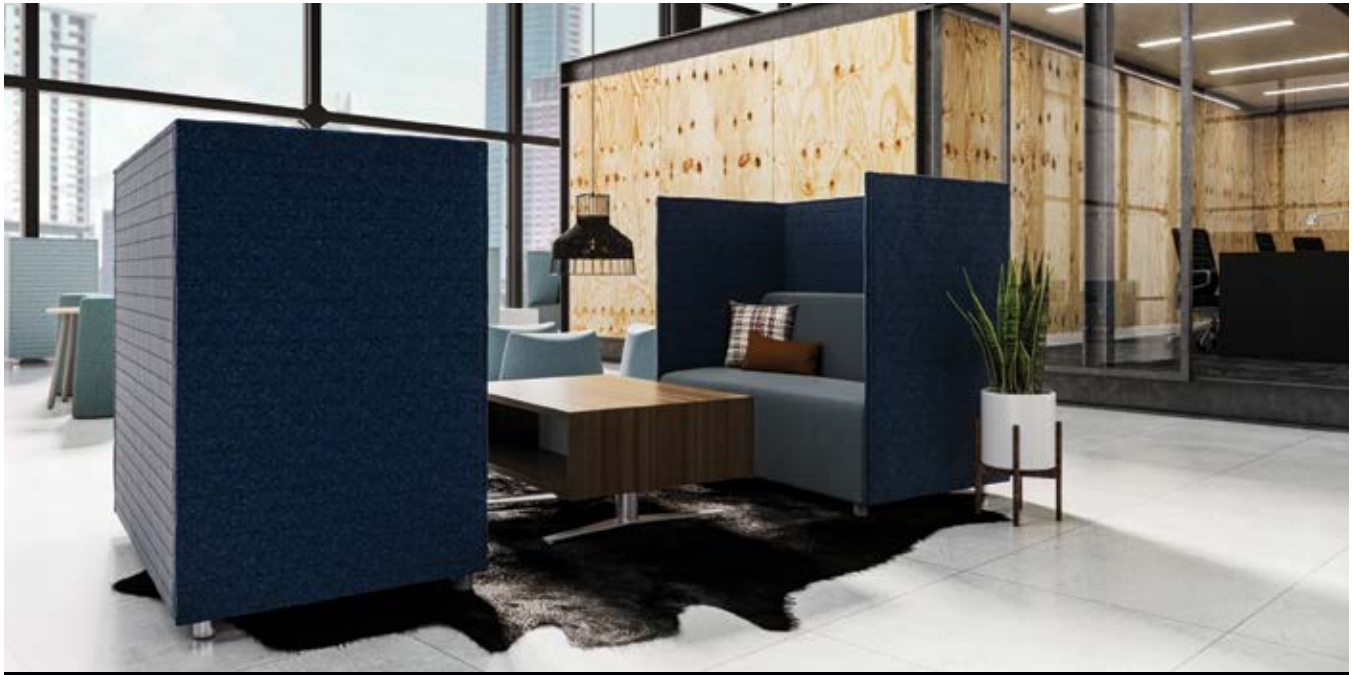
HOKR 2.0 PRIVACY ALCOVE