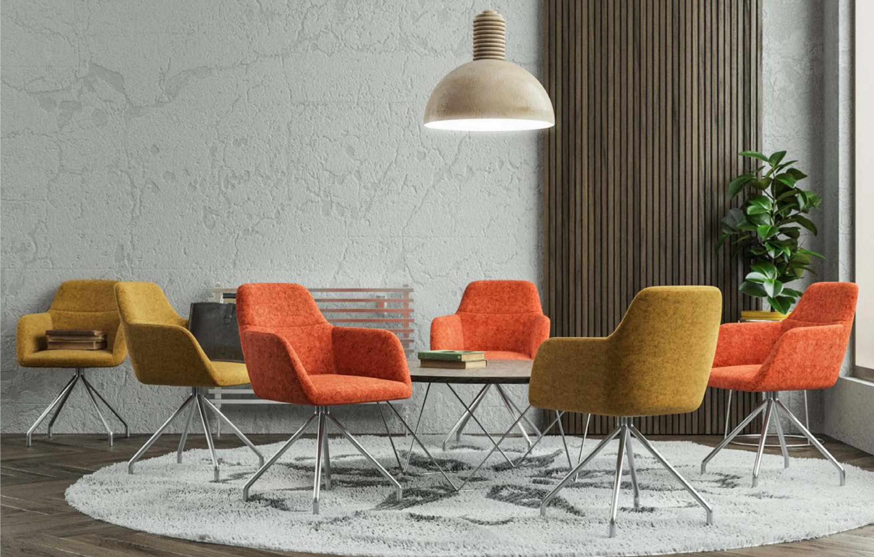
JUGGLE LARGE MEETING