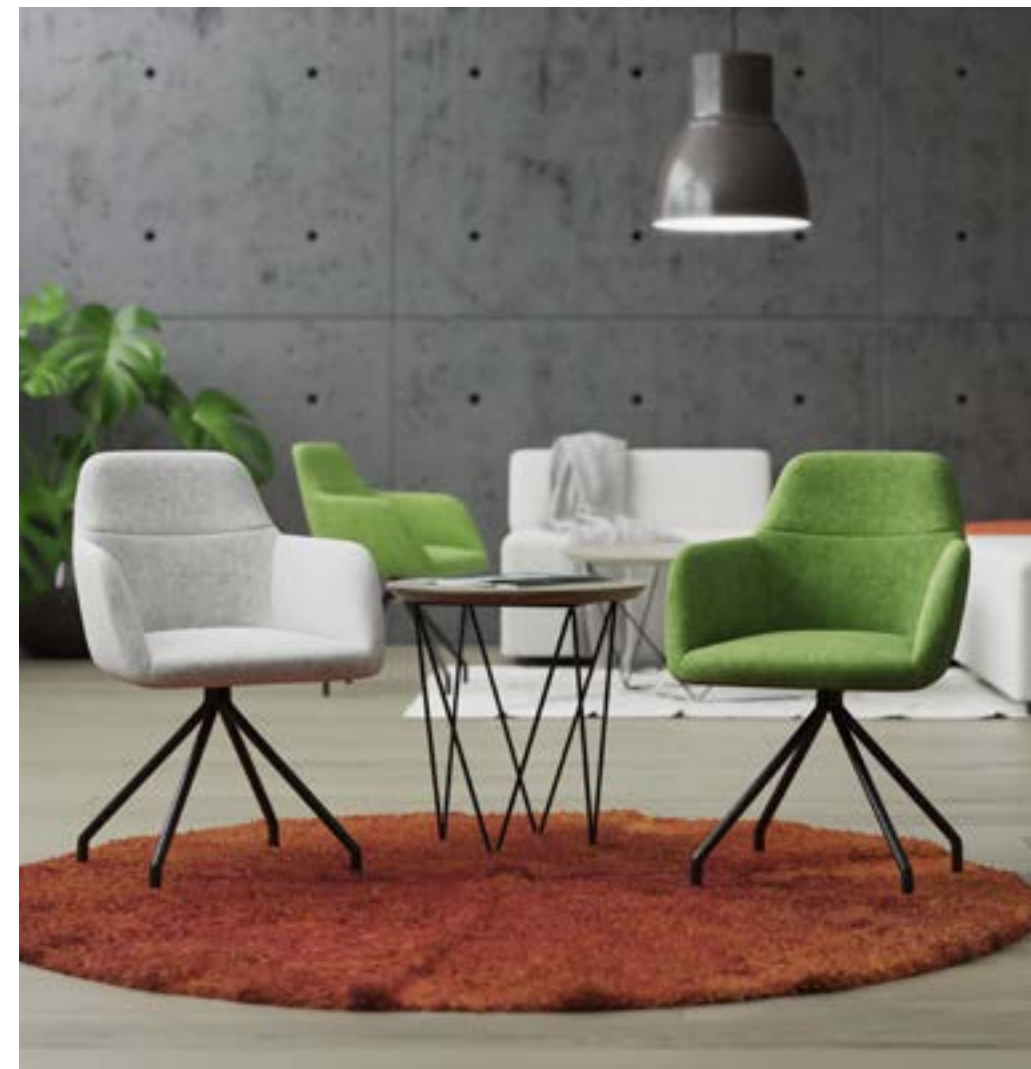
JUGGLE SMALL MEETING