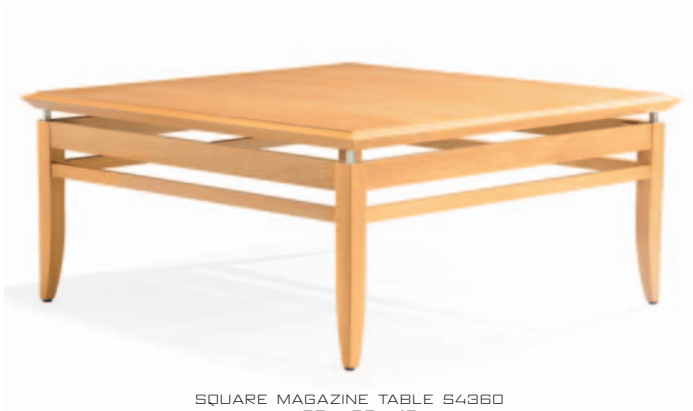
SQUARE MAGAZINE TABLE S4360 w 36 d 36 h 16