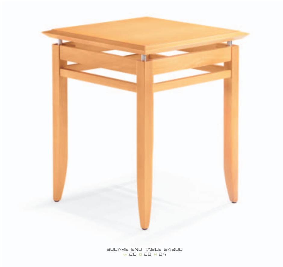
SQUARE END TABLE S4200 w 20 d 20 h 24