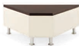
60° CONNECTOR TABLE (VENEER OR LAMINATE)

LEG OPTIONS FOUR WOOD LEGS FOUR SATIN NICKEL METAL LEGS