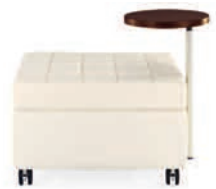
ONE SEAT BENCH OPTIONS: FOUR CASTERS POWER PORT TABLET POLE