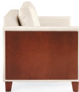
CLUB CHAIRS SHOWN WITH PLAIN DOWN-FILLED CUSHION UPHOLSTERY AND WOOD PANEL OUTER ARM OPTION. SOFA AND LOVESEAT ALSO AVAILABLE.

UPHOLSTERY OPTIONS BISCUIT-TUFT PLAIN DOWN-FILLED CUSHIONS