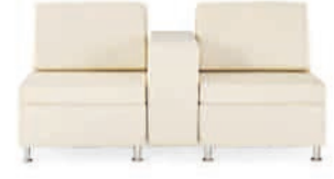
10-INCH CONNECTOR ARM [VENEER OR UPHOLSTERED]