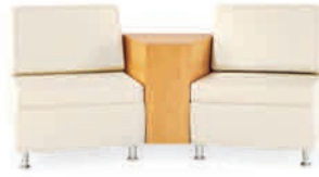
30° 10-INCH CONNECTOR ARM [VENEER OR UPHOLSTERED]