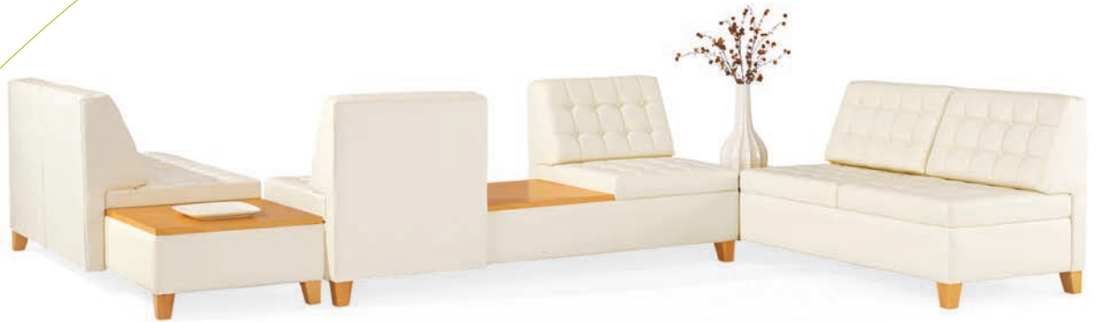
COMBINE OPPOSING BACK ARMLESS UNITS TO ACCOMMODATE MULTI-DIRECTIONAL SEATING ACCESS IN OPEN PLAN ENVIRONMENTS.