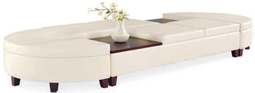
AN OPEN PLAN MODULAR ISLAND CONFIGURATION ALLOWS FOR MULTI-DIRECTIONAL SEATING ACCESS. HALF ROUND BENCHES NICELY CAP ENDS FOR CONTINUOUS FLOW.