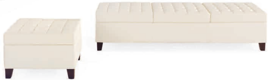
ONE, TWO, AND THREE SEAT FREESTANDING BENCHES ARE AVAILABLE WITH PLAIN OR BISCUIT-TUFT UPHOLSTERY OPTIONS.