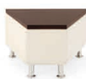
30° CONNECTOR TABLE (VENEER OR LAMINATE)