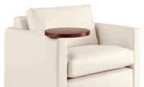
OPTIONAL ARTICULATING OVAL OR CIRCLE TABLE ROTATES 360°

LEG OPTIONS FOUR WOOD LEGS FOUR SATIN NICKEL METAL LEGS FOUR CASTERS