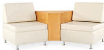
60° 10-INCH CONNECTOR ARM [VENEER OR UPHOLSTERED]

LEG OPTIONS FOUR WOOD LEGS FOUR SATIN NICKEL METAL LEGS