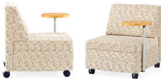
SPECIFY ONE-SEAT ARMLESS MODELS WITH OPTIONAL CASTERS AND TABLE POLE FOR COLLABORATIVE AREAS. OPTIONAL POWER PORT AVAILABLE.