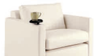
OPTIONAL CUP HOLDER (BLACK OR WHITE)