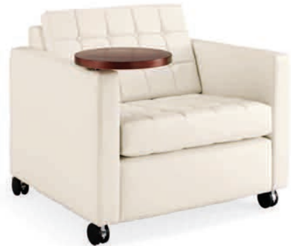
CLUB CHAIRS SHOWN WITH BISCUIT TUFT UPHOLSTERY. SPECIFY OPTIONAL CASTERS AND TABLE FOR COLLABORATIVE AREAS. SOFA AND LOVESEAT ALSO AVAILABLE.